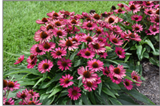
Kismet Raspberry Coneflower in bloom

Kismet Raspberry Coneflower will grow to be about 16 inches tall at maturity, with a spread of 24 inches. Its foliage tends to remain dense right to the ground, not requiring facer plants in front. It grows at a fast rate, and under ideal conditions can be expected to live for approximately 10 years. As an herbaceous perennial, this plant will usually die back to the crown each winter, and will regrow from the base each spring. Be careful not to disturb the crown in late winter when it may not be readily seen!