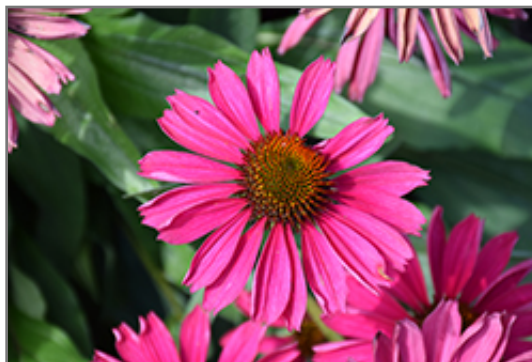
Kismet Raspberry Coneflower flowers