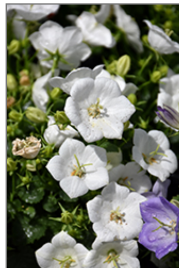
Rapido White Bellflower flowers