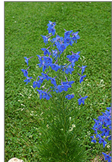
Chinese Delphinium flowers