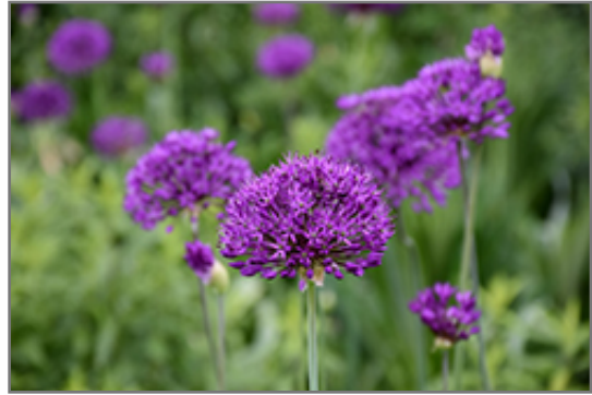
Purple Sensation Ornamental Onion flowers

This is a relatively low maintenance plant, and should only be pruned after flowering to avoid removing any of the current season's flowers. It is a good choice for attracting butterflies to your yard, but is not particularly attractive to deer who tend to leave it alone in favor of tastier treats. It has no significant negative characteristics.