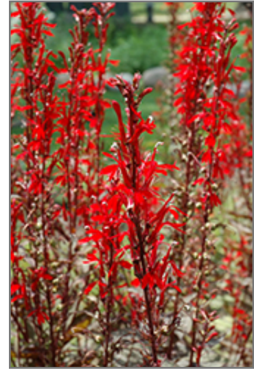
Black Truffle Cardinal Flower flowers