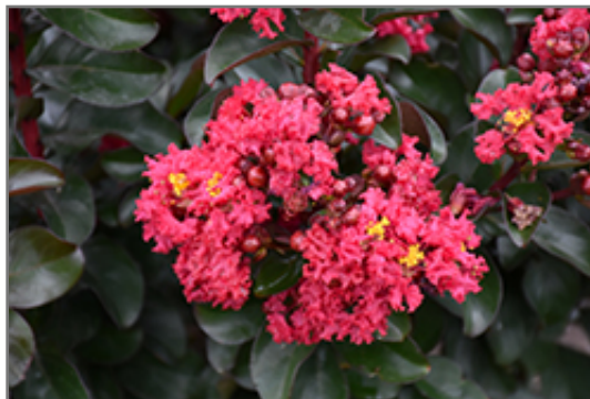
Cherry Mocha Crapemyrtle flowers

Cherry Mocha Crapemyrtle is recommended for the following landscape applications;