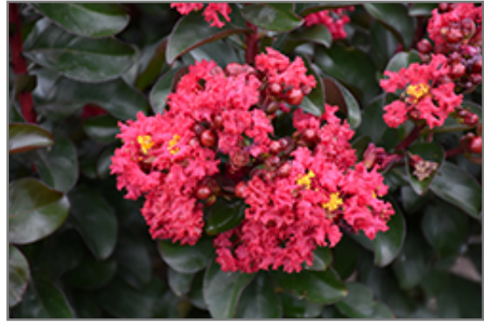
Cherry Mocha Crapemyrtle flowers

Cherry Mocha Crapemyrtle is recommended for the following landscape applications;