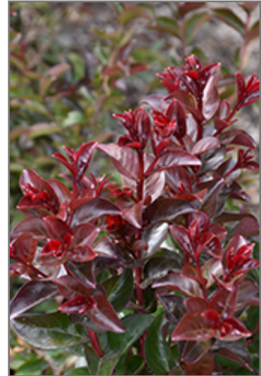
Cherry Mocha Crapemyrtle foliage

Cherry Mocha Crapemyrtle makes a fine choice for the outdoor landscape, but it is also well-suited for use in outdoor pots and containers. With its upright habit of growth, it is best suited for use as a 'thriller' in the 'spiller-thriller-filler' container combination; plant it near the center of the pot, surrounded by smaller plants and those that spill over the edges. It is even sizeable enough that it can be grown alone in a suitable container. Note that when grown in a container, it may not perform exactly as indicated on the tag - this is to be expected. Also note that when growing plants in outdoor containers and baskets, they may require more frequent waterings than they would in the yard or garden.