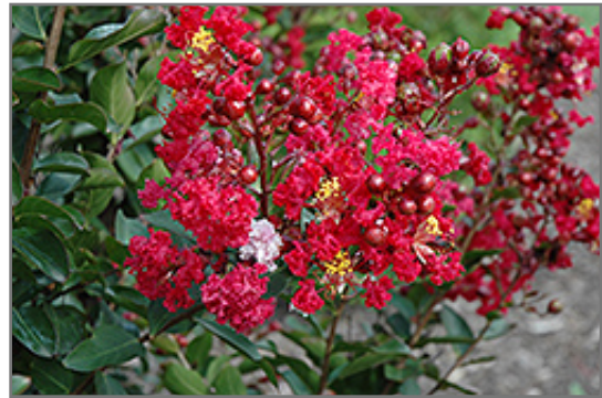
Red Rooster Crapemyrtle flowers

Red Rooster Crapemyrtle is recommended for the following landscape applications;