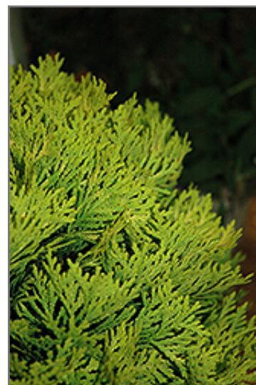
Anna's Magic Ball Arborvitae foliage