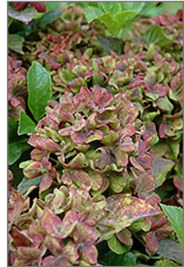
Pistachio Hydrangea flowers