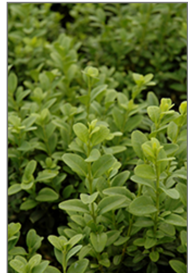
Julia Jane Boxwood foliage