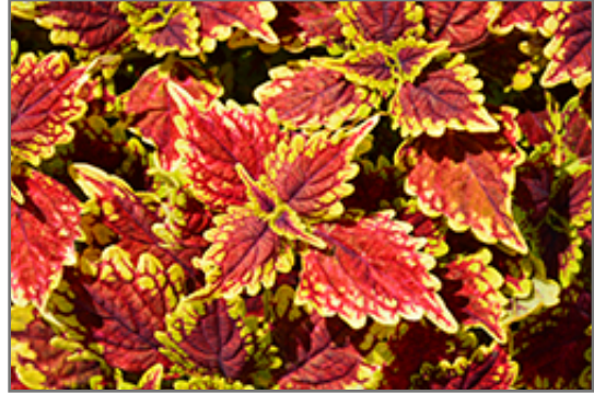
Oxford Street Coleus foliage