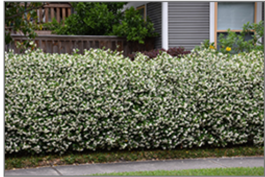
Confederate Star-Jasmine in bloom