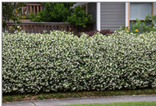
Confederate Star-Jasmine in bloom