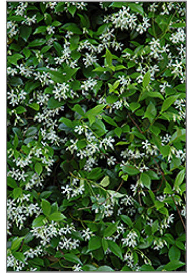
Confederate Star-Jasmine flowers