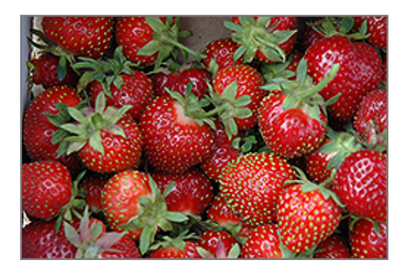
Chandler Strawberry fruit

Chandler Strawberry features dainty white daisy flowers with yellow eyes along the stems in mid spring. Its tomentose round compound leaves remain green in color throughout the season. It features an abundance of magnificent cherry red berries in early summer.