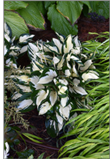
Fire and Ice Hosta

Fire and Ice Hosta is recommended for the following landscape applications;