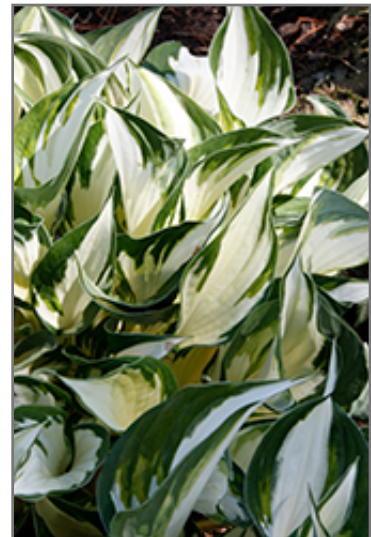
Fire and Ice Hosta foliage